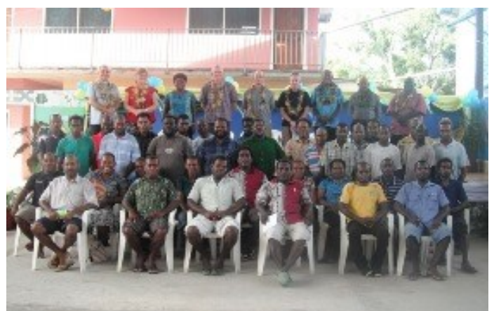
Wintech Tarahahi training participants

Organized by the Catholic diocese of Gizo, and was facilitated by the Caritas NZ.