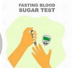
To be continue next issue