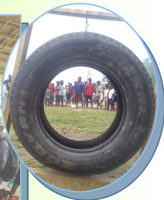
St. Peter Gizo Catholic community raised a total of $35,672.40 on